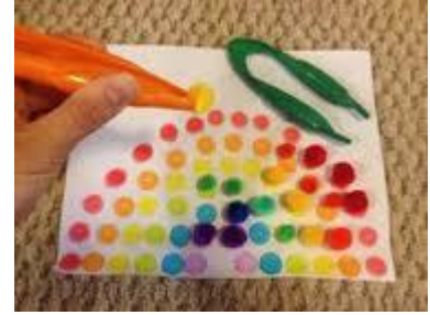
Finger dot rainbow, tweezers place pom pom balls