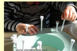
golf tee and foam