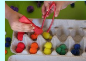
Fill the egg crate with pom, sninv balls using tones