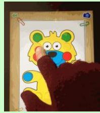
Finger isolation glove old sock or glove