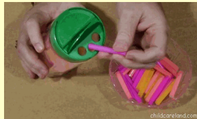
straws in parmesian bottle