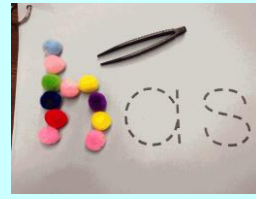
letter writing with pom-pom and tweezers