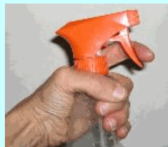
sidewalk chalk and squirt bottle