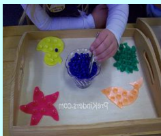
Anti slip bath tub applique Tones and pom poms