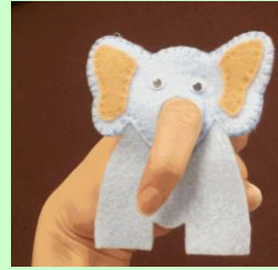
Fun foam or felt finger puppets