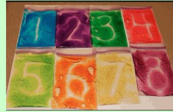
Colored gel bags for finger writing