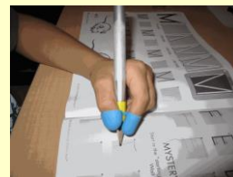
Writing CLAW at amazon