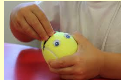
Feed the tennis ball with pennies, lids